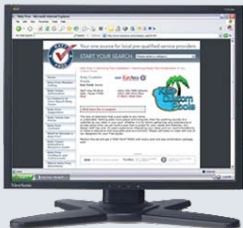
It is easy to find what you need on Katy Pros' site